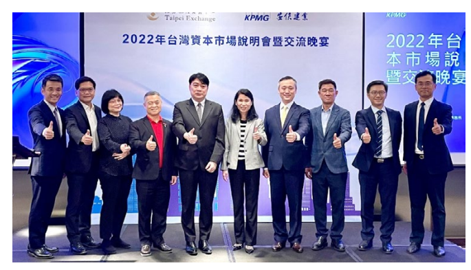
After three years, TPEx visited Vietnam after the pandemic for the first time to promote listing of overseas enterprises on Main Board