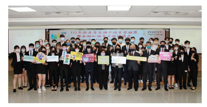
TPEx jointly held the 2022 Financial Elite Camp Award Ceremony and "Striking the Gong for Financial Literacy Campaign" to support WIW