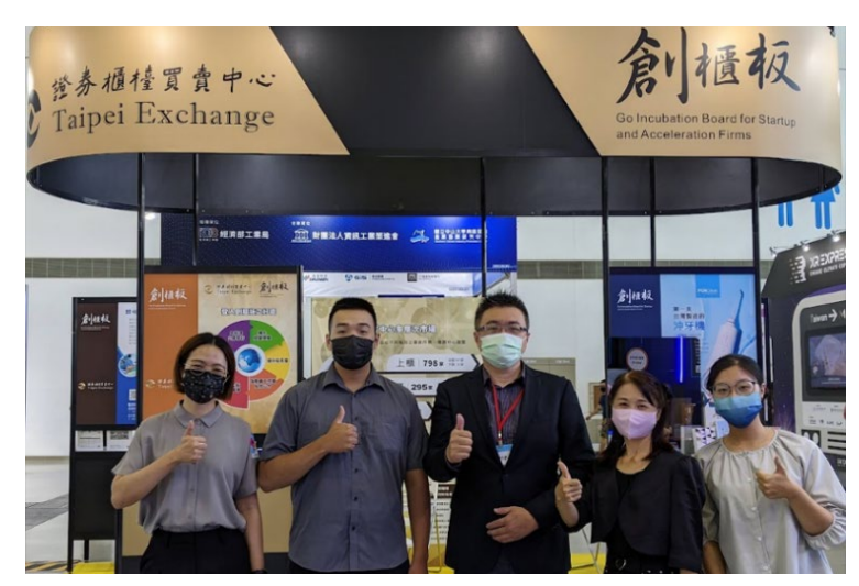
TPEx participated in "2022 Meet Greater South Expo" with GISA companies

Since its establishment, TPEx has followed the development trend of the international capital market and actively supported small and medium-sized enterprises to enter the capital market. With the strategic goal of building "multi-functional and multi-tiered comprehensive exchange", after years of development, TPEx has built a complete multi-tiered capital market structure. Through stageby-stage incubation, it assists micro, small and medium-sized, and even large enterprises to select suitable listing boards based on their own scale and development needs. At the same time, through relevant counseling mechanisms, financing channels and appropriate supervision systems, the companies can continuously strengthen their operation guality through the capital market platform. TPEx has been recognized as one of the most successful SME exchanges in the world by the World Bank with its excellent development performance.